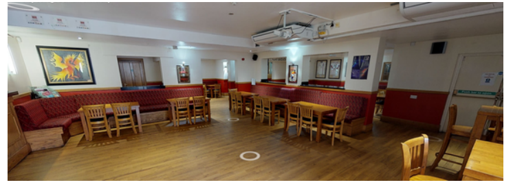
The Bar - We use this space as a break out room but also host a great game of bingo here.