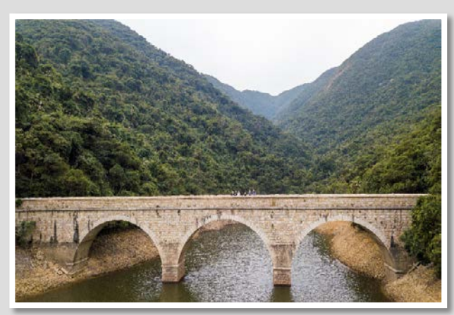
Hiking on a heritage trail