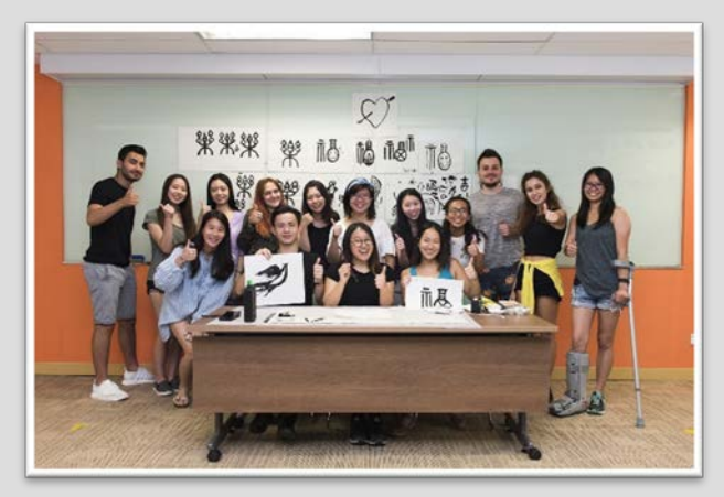
Chinese Calligraphy Class