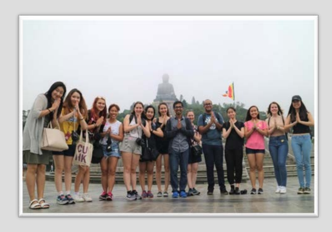
Visiting the Big Buddha