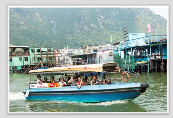
Boat trip to outlying islands