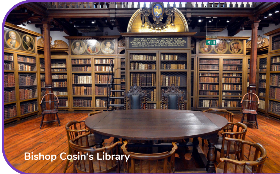
Bishop Cosin's Library

Bishop Cosin's Library (11am-3pm Sat. and Sun.) One of the earliest 'public' libraries Conservation work completed 2022 Enter from within Palace Green Library Booking of tickets on-line or through reception at Palace Green Library Tel. 0191 334 2932 Free